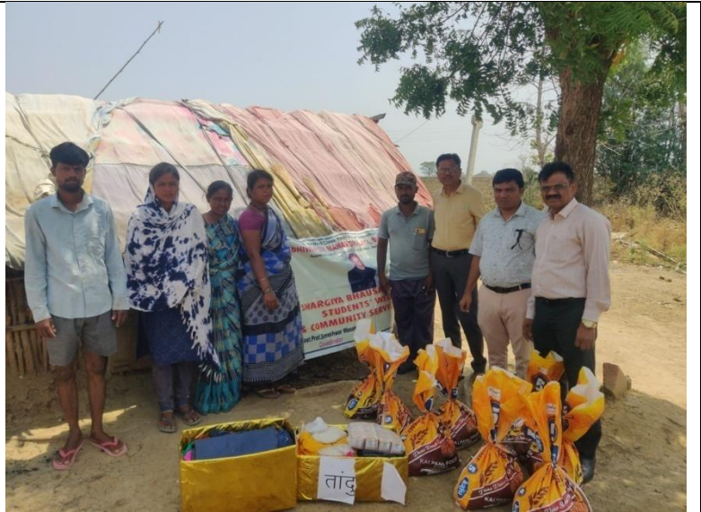
A few glimpses of the philanthropic activity.