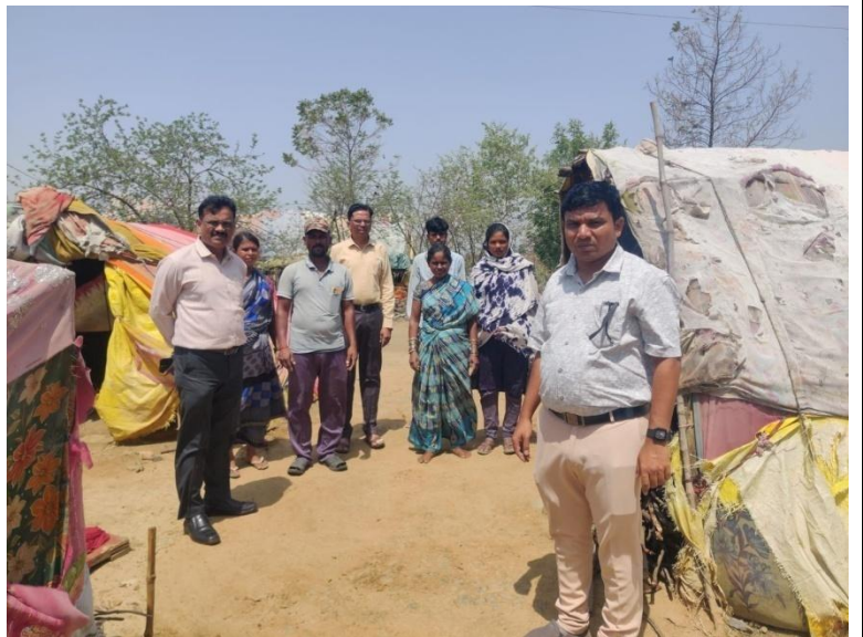
A few glimpses of the philanthropic activity.