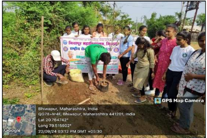
Volunteers, in action, during the Sapling Plantation Drive.