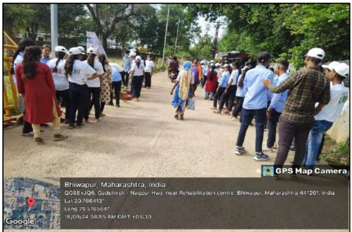
Volunteers, in action, during the Cleanliness Drive.