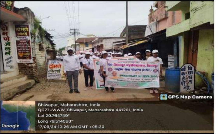
Participants, in action, during the Awareness Rally about the ‘Swachhata Pakhwada’