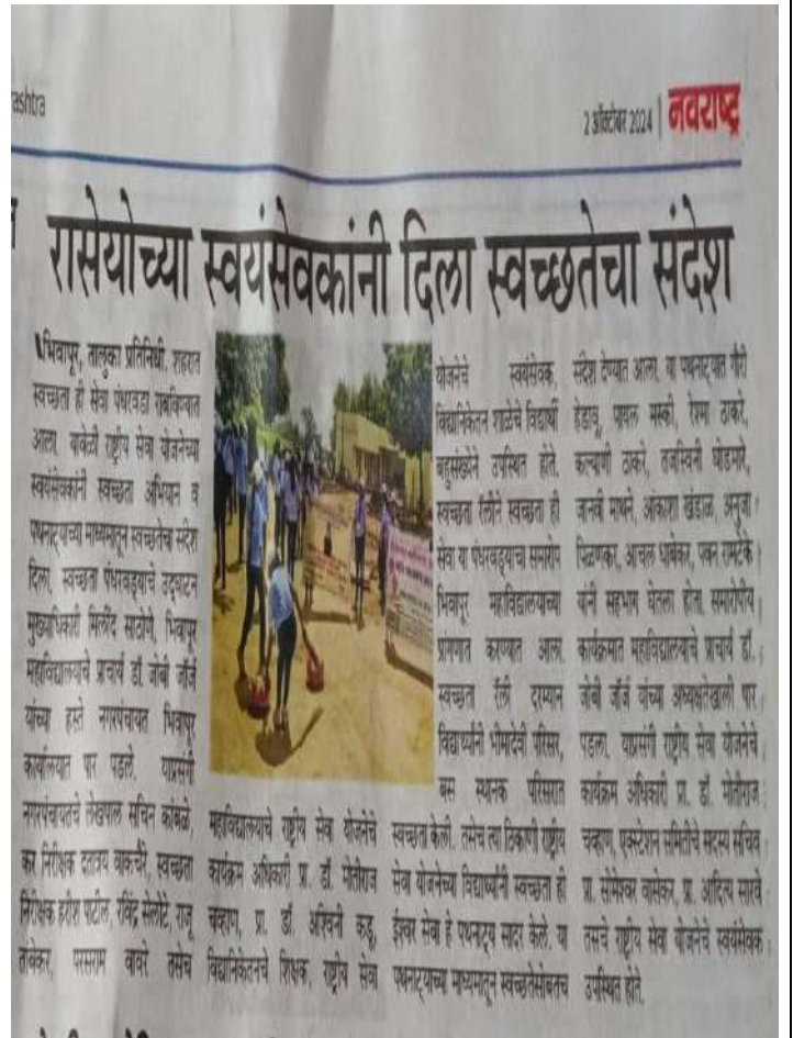
Daily 'Navrashtra', Dated: 2 nd October, 2024