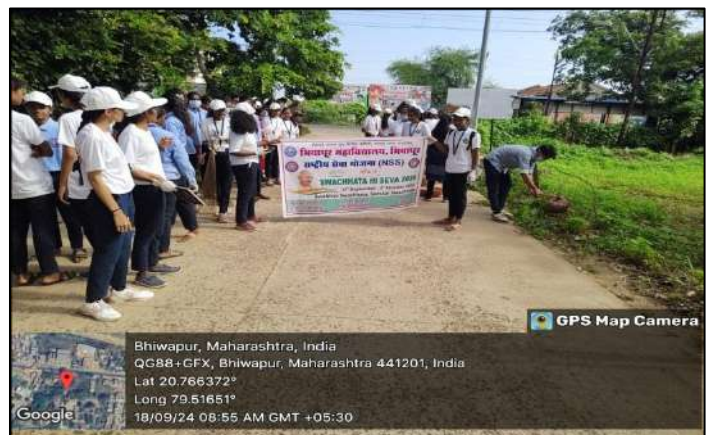
Volunteers, in action, during the Cleanliness Drive.