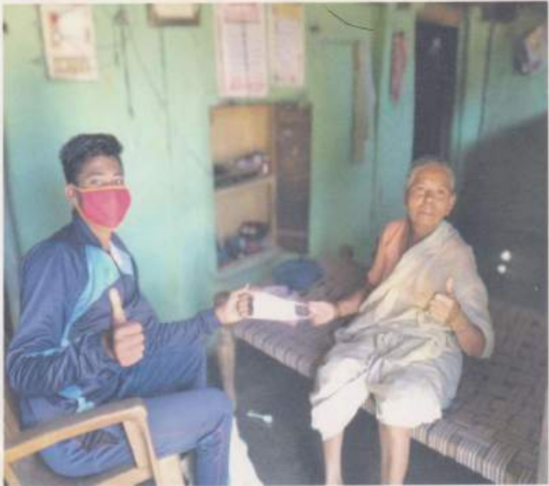
Mask distribution by the College student