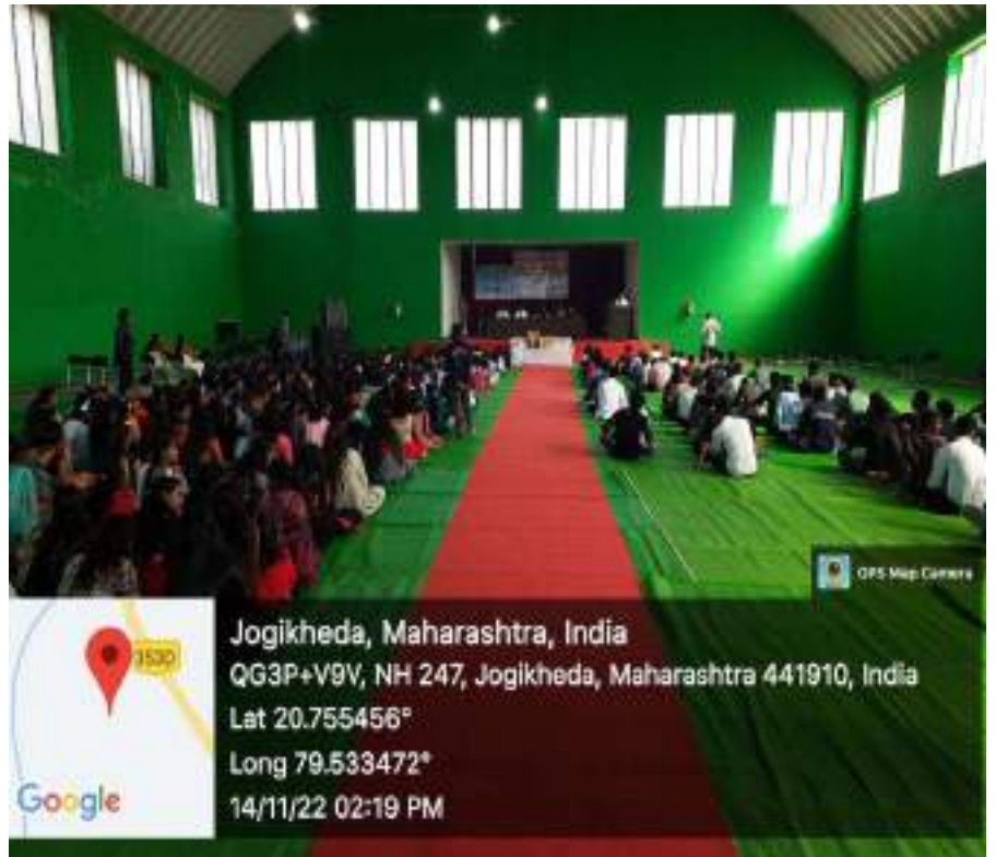
Programme at a glance