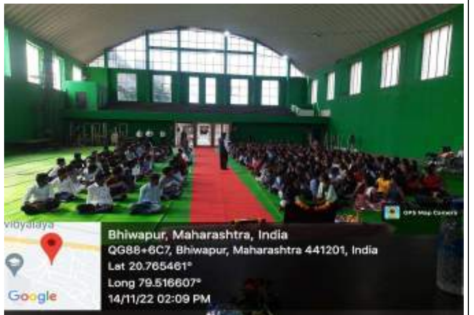
Programme at a glance