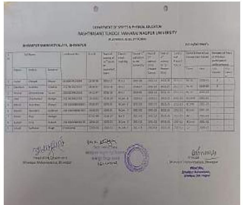
Eligibility Form of Volleyball Team