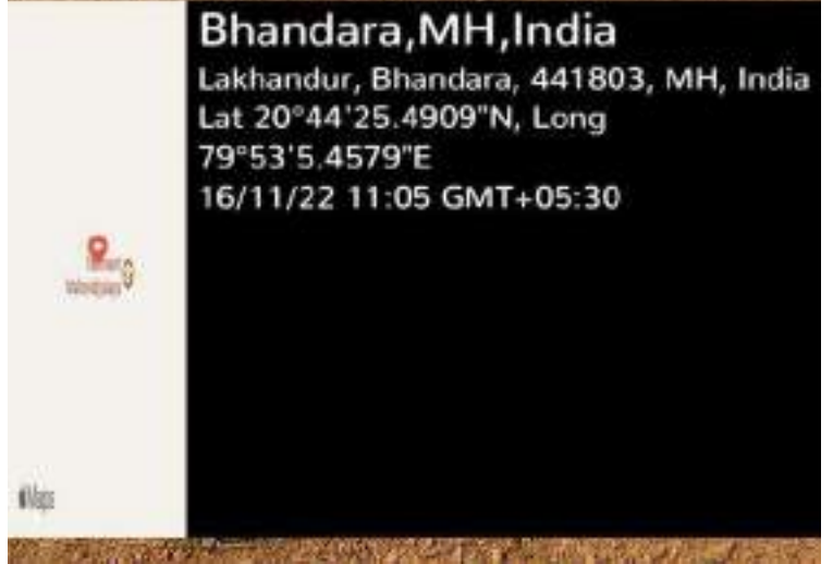
Boys, in action, during Inter Collegiate Volleyball Tournament against Saket College of Physical Education in Lakhandur.