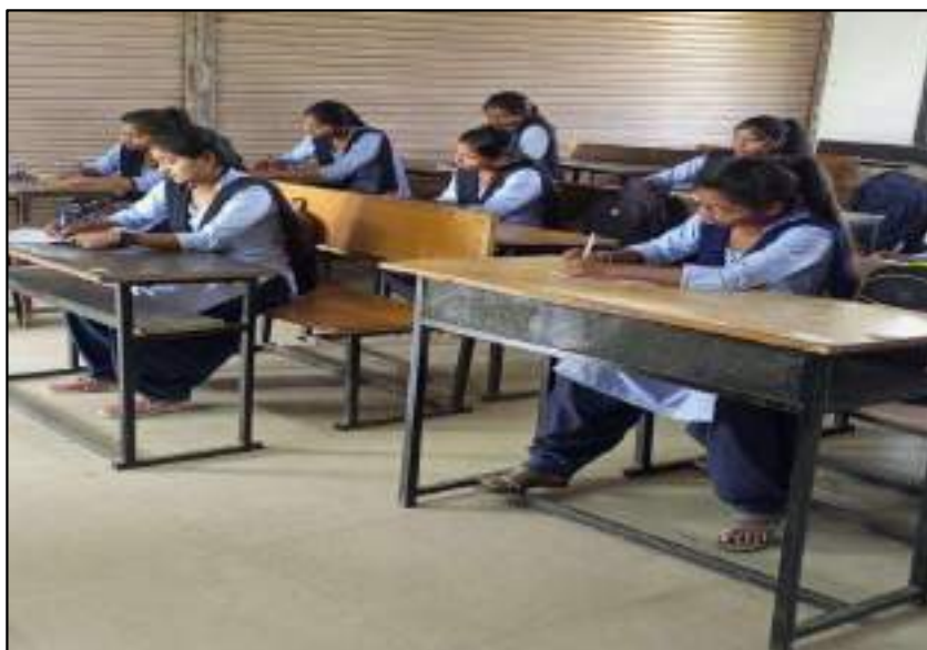
Students engrossed in 'Essay Writing Competition'