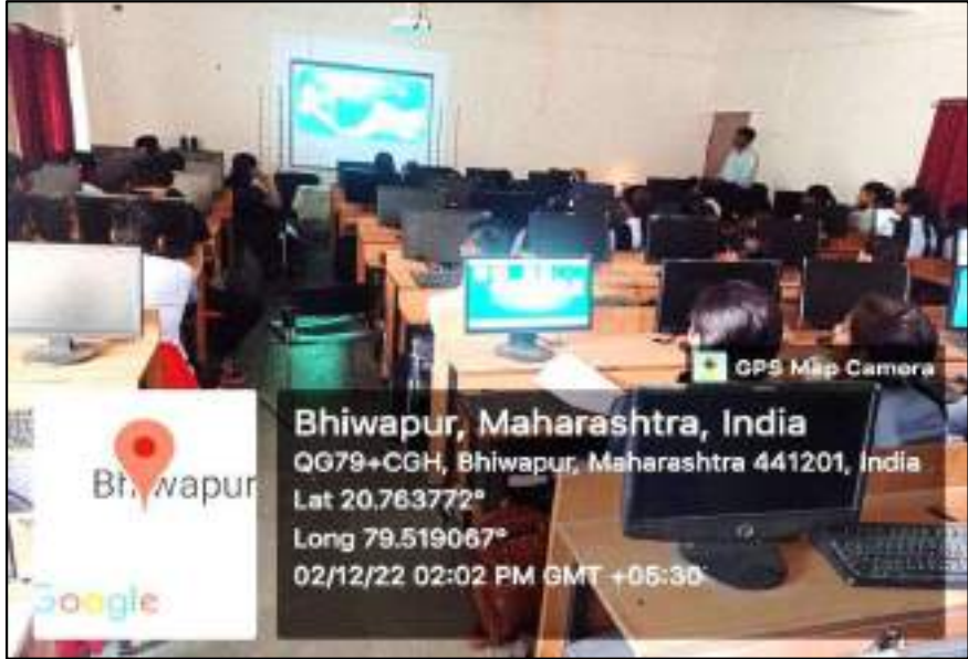
Screening of Documentary on pollution-related issues during the Programme