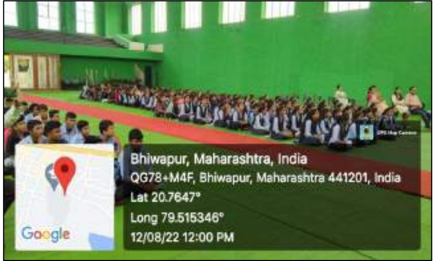
Students in large numbers participated in the Death Anniversary Programme of Lokmanya Tilak on 12 th August,2022.