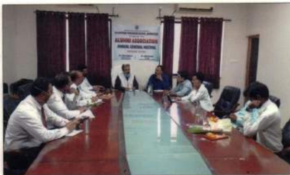
Members of the Alumni Association attended the offline and online meeting mode on 27/11/2021