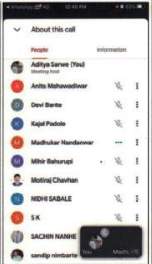
Members of the Alumni attending the Online meeting