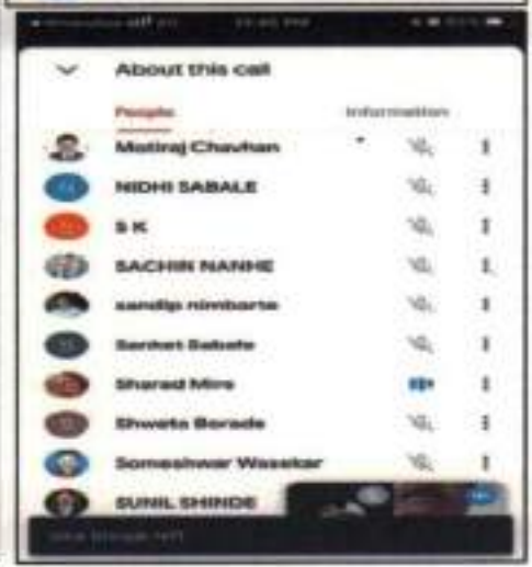
Ex- Alumni attending the online meeting