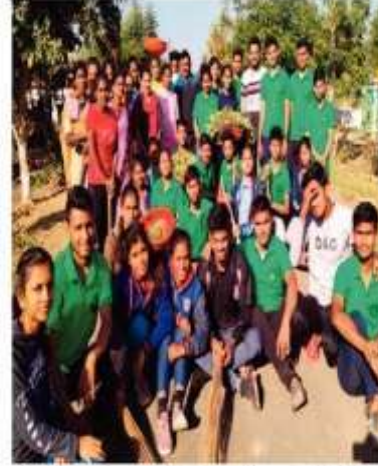
गोसेखुर्द प्रकल्पबाधित सातेराहरी-सातेभट्टी पुनर्वसित गावात निवासी शिबिरात श्रमदान करणारे रासेयोचे विद्यार्थी.

भिवापूर महाविद्यालयाच्या राष्ट्रीय सेवा योजनेच्या वतीने तालुक्यातील सातेराहरी-सातेभट्टी या गोसेखुर्द पुनर्वसित गावात 'दुवकांचा ध्यास ग्राम-शहर विकास' या संकल्पनेवर आधारित सात दिवसीय निवासी