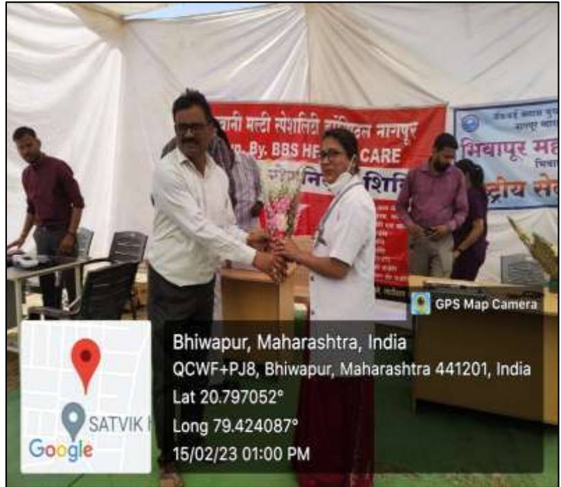
Committee Members of N.S.S. along with the team of Doctors during the 'Free Medical Check-up Camp'