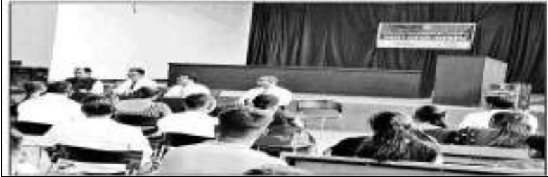
Daily 'Deshonnati', Dated 7 th February 2022