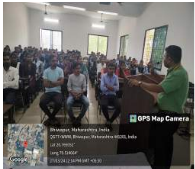
Mr. Uprakar conducting the Session on the Second Day of the Workshop