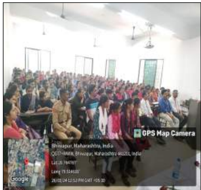
Participants enjoying the Inaugural Session of the Workshop