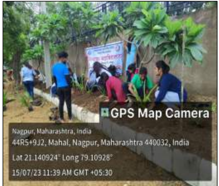
N.S.S Volunteers planting saplings during the Tree Plantation Drive.