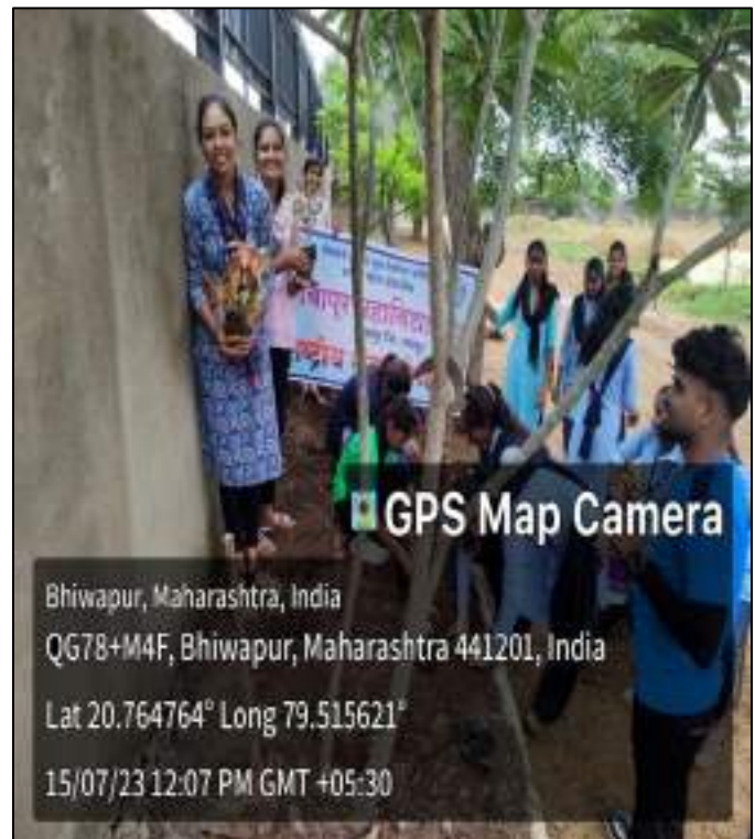
N.S.S Volunteers planting saplings during the Tree Plantation Drive.