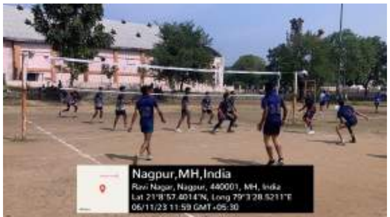
Boys, in action, during the Volleyball Quarter-final