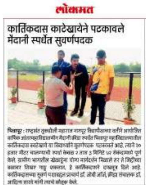
Holla Nagpur Edition Page No. 2 Nov 12, 2023