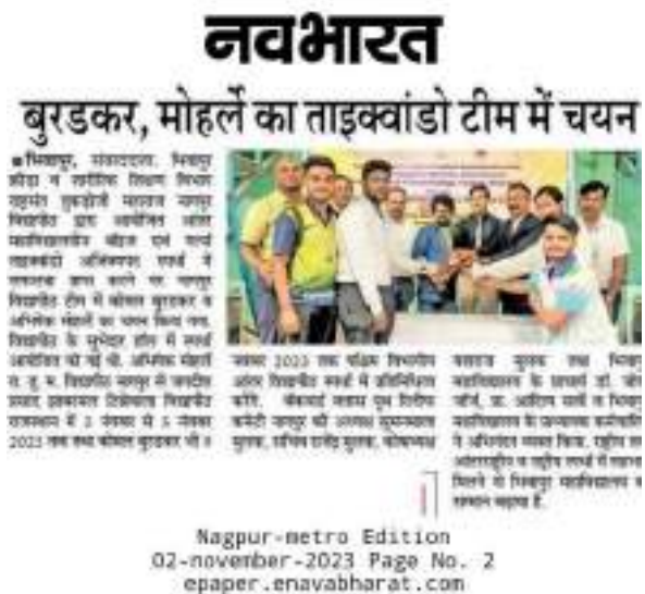
Nagpur-metro Edition 02-november-2023 Page No. 2 epaper.enavabharat.com