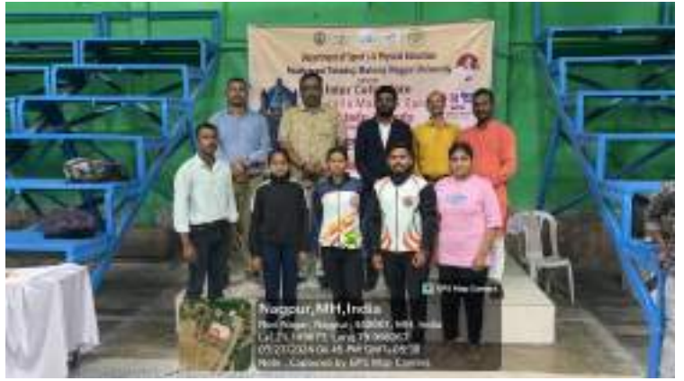
Champions of our College, showcasing their Gold Medals, bagged in Ashtedu Akhada