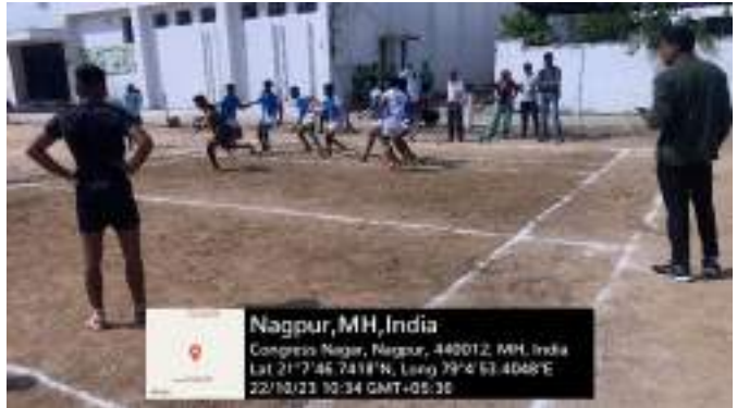
Boys, in action, during Kabaddi Match, at Dhanwate National College, Nagpur