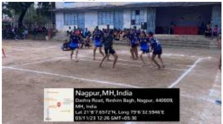
Girls, in action, during the Kabaddi Match at C. P. & Berar College, Reshimbagh, Nagpur.