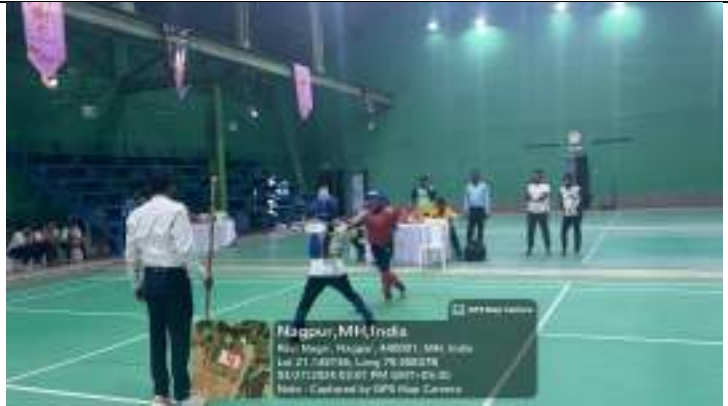
During Ashtedu Akhada Final Match, at Subhedar Hall, Nagpur