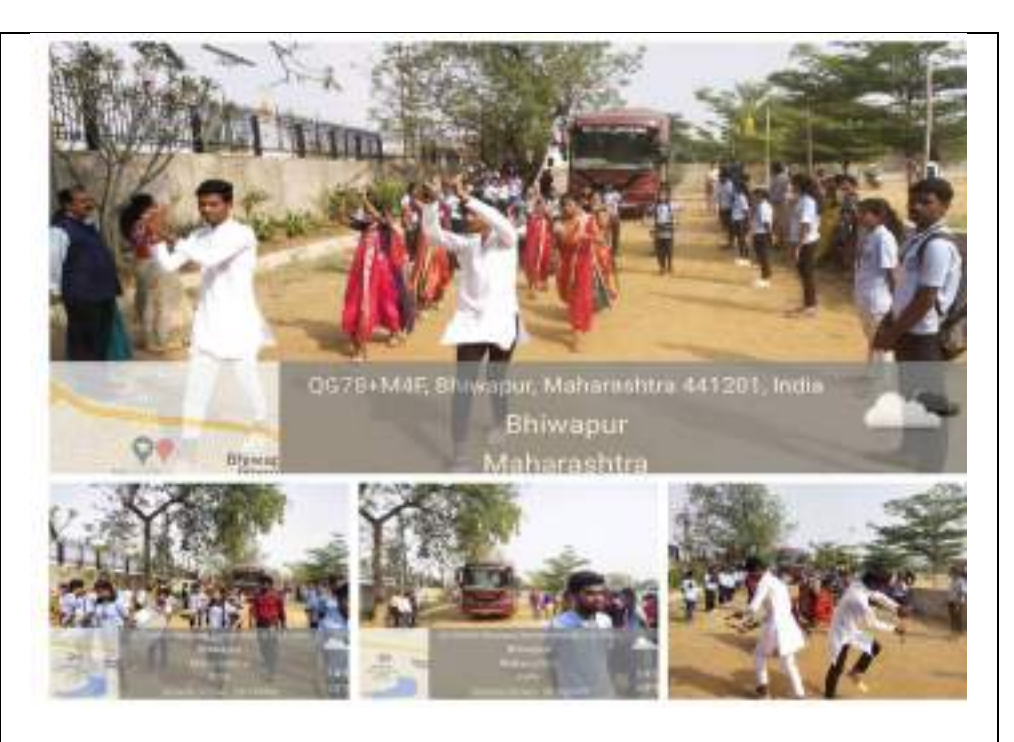
The College Dance Troupe performing Lezim to welcome ISROs vehicle , 'Space on Wheels'

GEOTAGPHOTOGALLERYWITHCAPTIONS (Only GEOTAGphotos covering the entiregamut/ span of the activitywill be accepted)