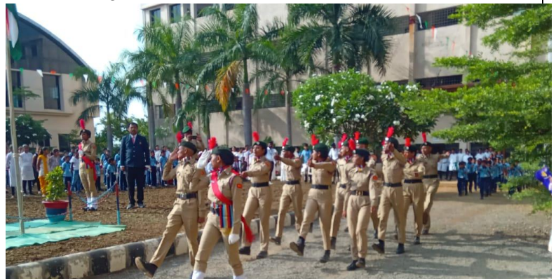
The NCC Cadets, in action, offering Guard of Honour to the National Flag.