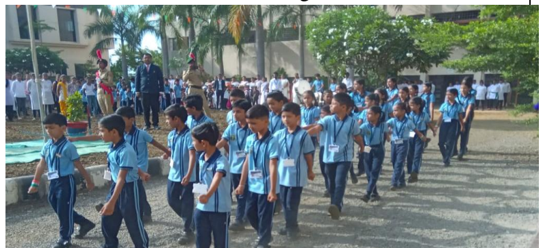
The NCC Cadets, in action, during the March Past