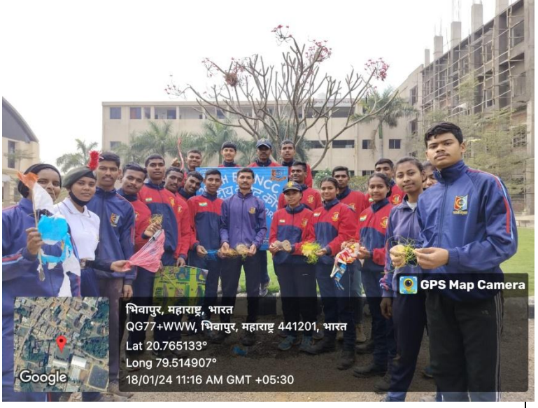
Cadets with broken kites and Manja waste