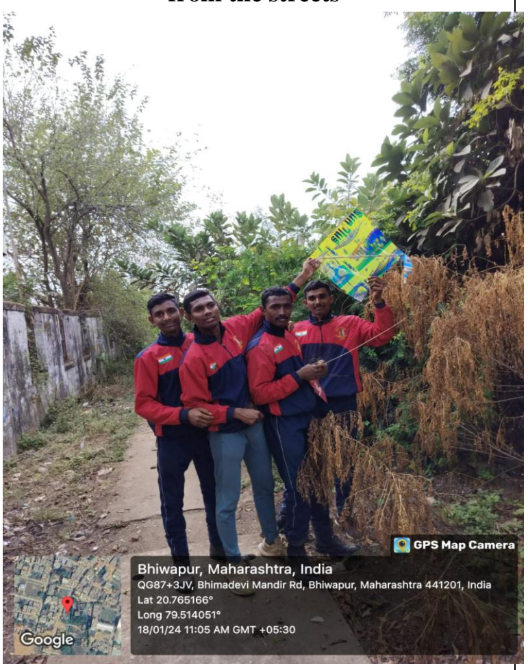
Cadets collecting broken kites and waste Manja from the streets