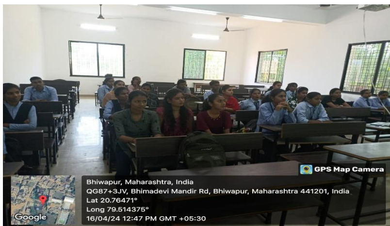
Students engrossed in the Lecture on 'Chemical Kinetics'