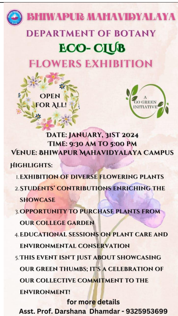
Brochure of the Event