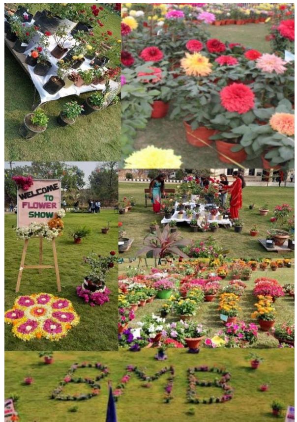
Collage of Photos of the Flower Show