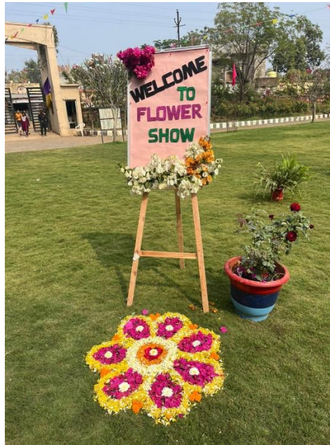
Students' Creativity: The Welcome Board