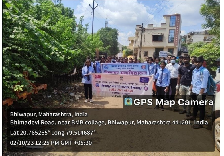
Bhiwapur, Maharashtra, India Bhimadevi Road, near BMB collage, Bhiwapur, Maharashtra 441201, India Lat 20.765265° Long 79.514687° 02/10/23 12:25 PM GMT +05:30

Our students participating in the 'Cleanliness Drive' organized near BSNL Office, Bhiwapur on 2 nd October, 2023.