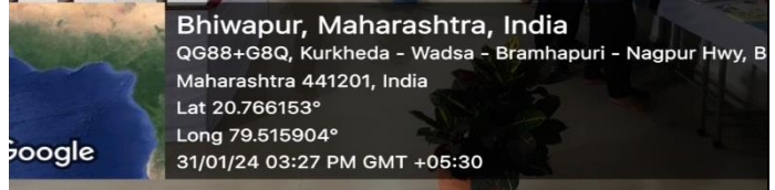
Students interestingly surfing the pages of Books kept in the Book Exhibition