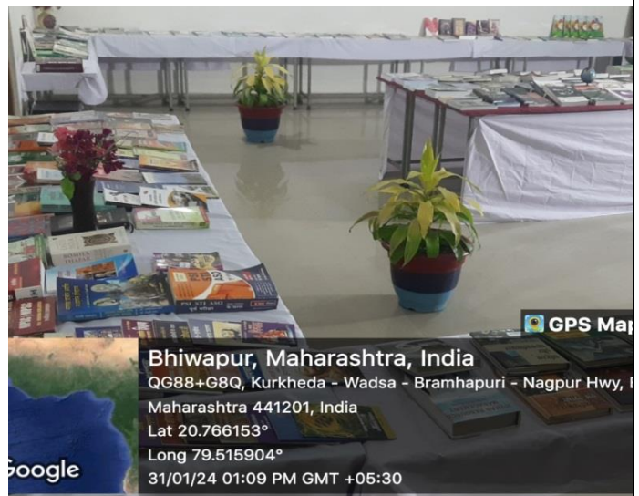
Book Exhibition at a glance

Bhiwapur, Maharashtra, India QG88+G8Q, Kurkheda - Wadsa - Bramhapuri - Nagpur Hwy, Maharashtra 441201, India Lat 20.766153° Long 79.515904° 31/01/24 01:09 PM GMT +05:30