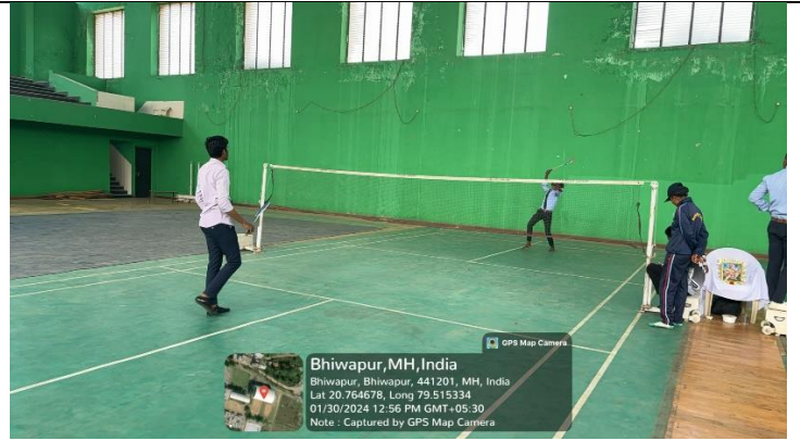
Boys, in action, during the Badminton Match