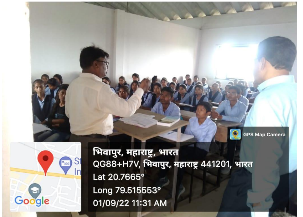
Programme at a glance