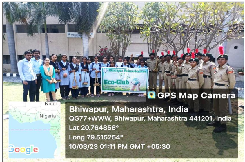
Students and N.C.C. Cadets ready to set-up Bird Bath