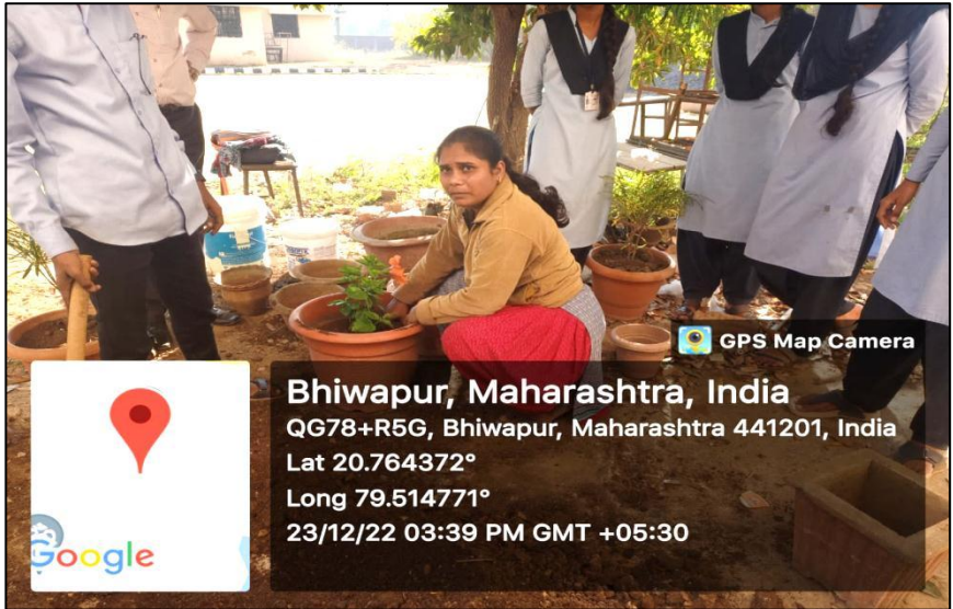
Students engrossed in the Sapling Plantation Drive