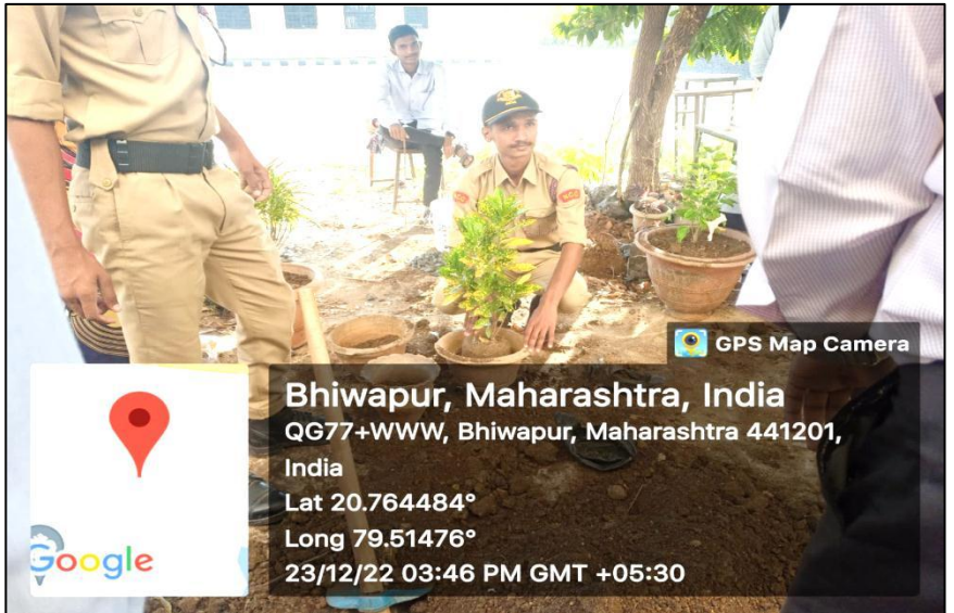
Students engrossed in the Sapling Plantation Drive