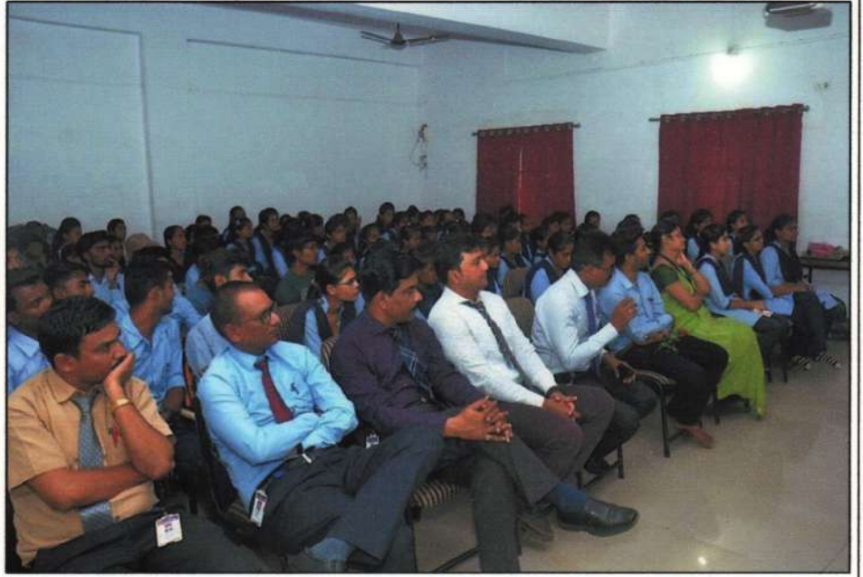
Students and teaching staff attending the Inaugural Ceremony Marathi Subject Literary Association.