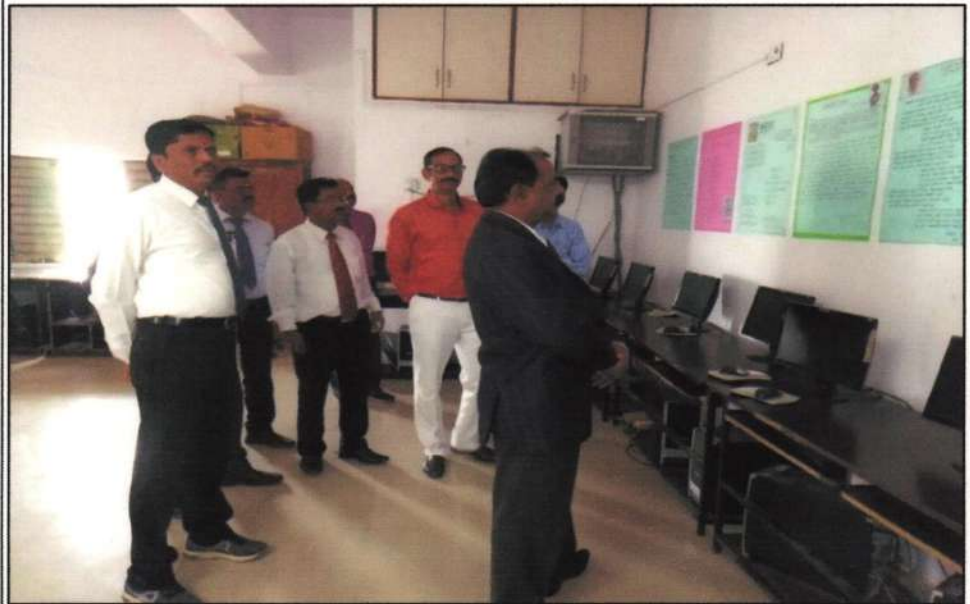
Dignitaries watching the Posters displayed during the Inaugural Ceremony of Marathi Subject Literary Association.