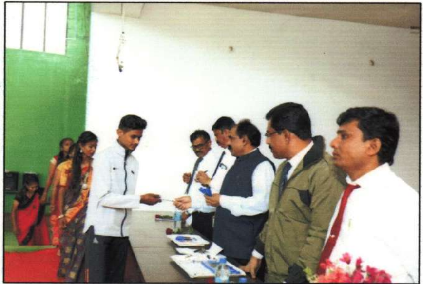
Students were welcomed with gifts on the occasion of Students' Induction Programme on 14 th November, 2022.