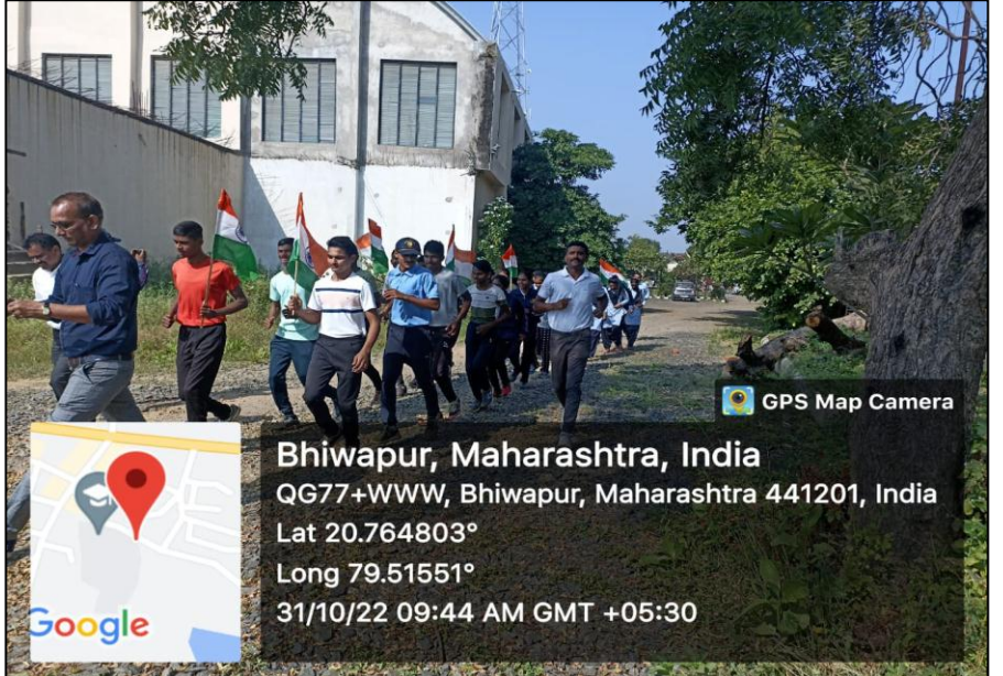
Students and members of teaching staff taking active participation in the 'Run for Unity' Campaign.