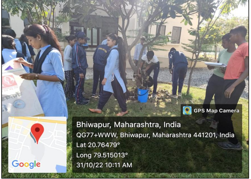
The NCC Cadets and the Volunteers of N.S.S. undertaking 'Cleanliness Drive'.