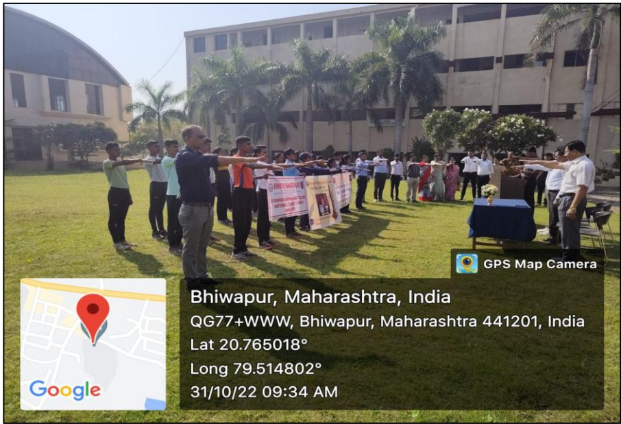
Students participating in the 'Run for Unity' Campaign.

Bhiwapur, Maharashtra, India QG77+WWW, Bhiwapur, Maharashtra 441201, India Lat 20.764953° Long 79.51478° 31/10/22 09:30 AM