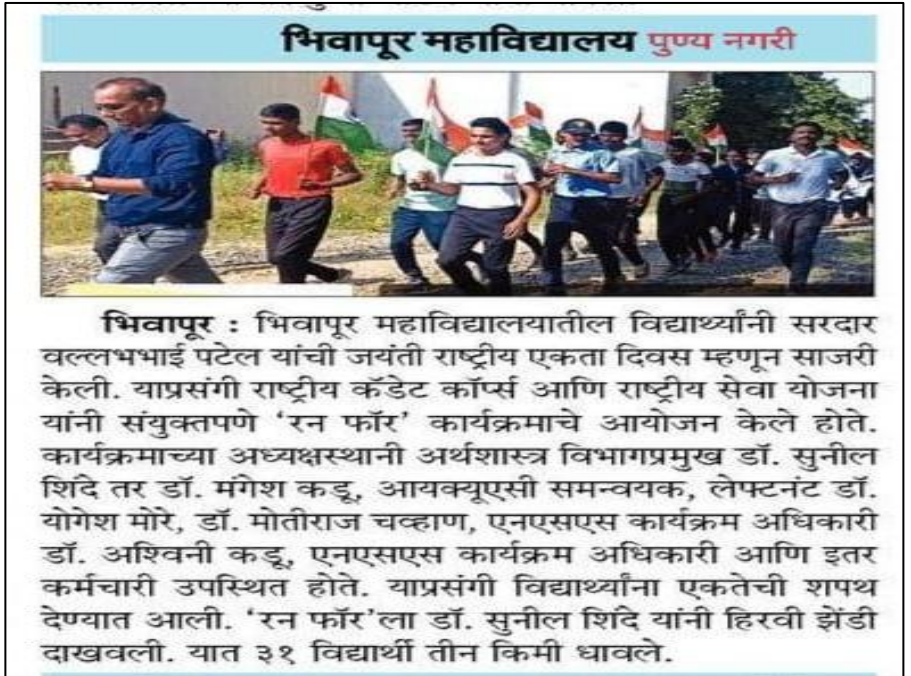
The Daily "Punya Nagari" Newspaper Dated:1 st November, 2022.