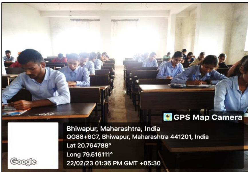
An Essay Writing Competition was held on 22 nd February, 2023 for the students of Junior and Senior College during the Week-long Celebrations of National Science Day from 22 nd to 28 th February, 2023