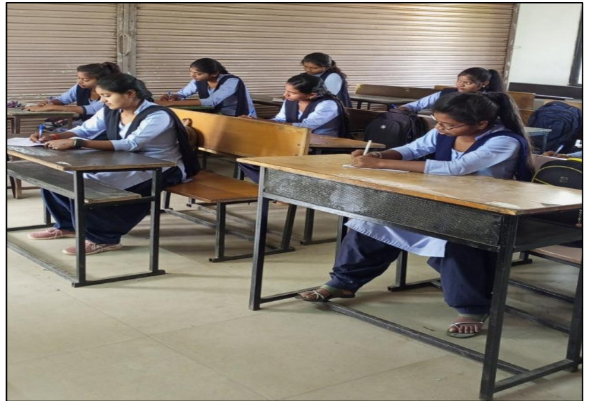
Students engrossed in 'Essay Writing Competition'