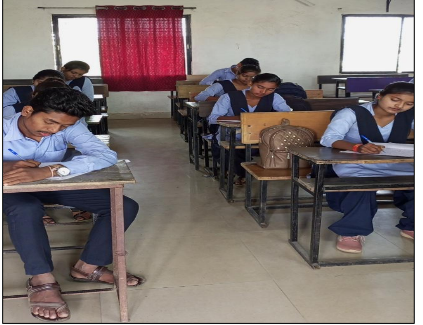
Students engrossed in 'Essay Writing Competition'