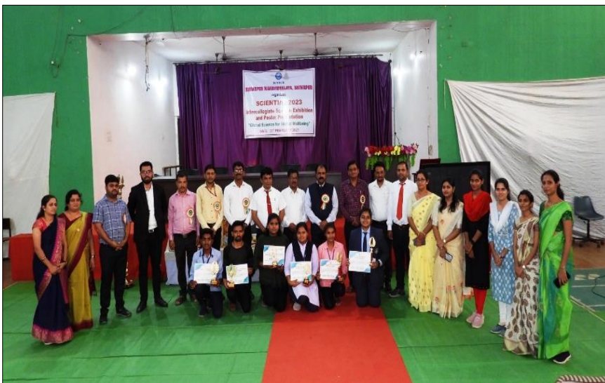
Winning Participants showcasing their achievements with the Principal and other dignitaries.