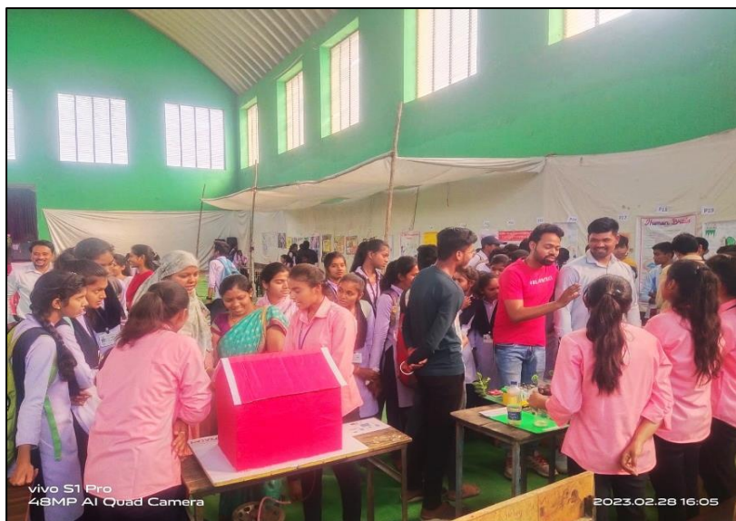
Local students and faculties interacting with the participants during the Science Exhibition organized on the occasion of National Science Day.