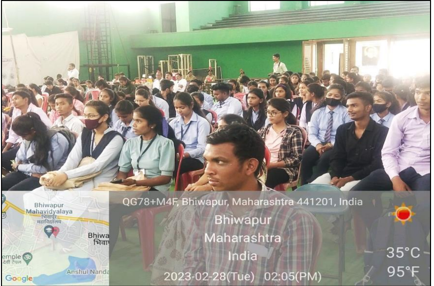
Participants attending the Event