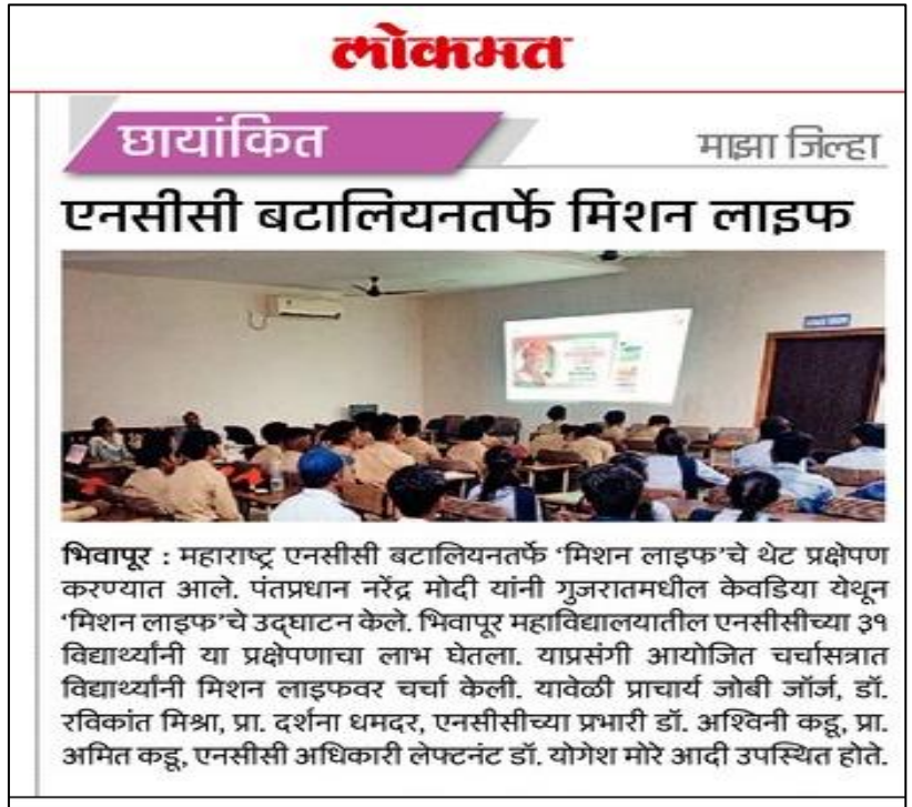
The News Item published in Lokmat Daily on 22 nd October, 2022.