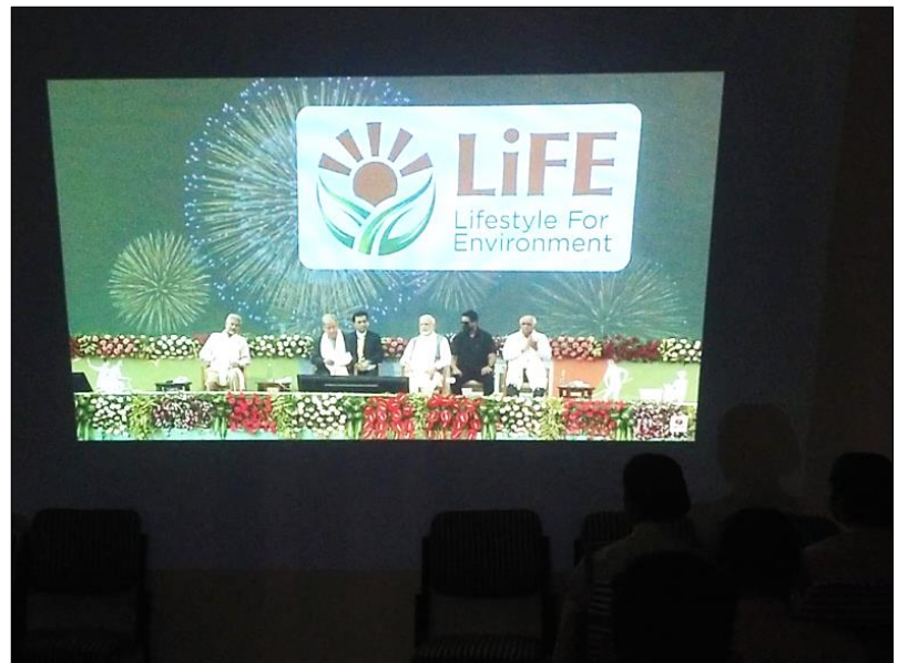
Live streaming of Mission LiFE Campaign.