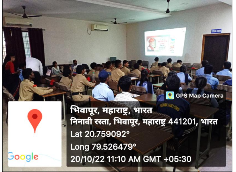
Students witnessing the live telecast of the launching of Mission LiFE Campaign.