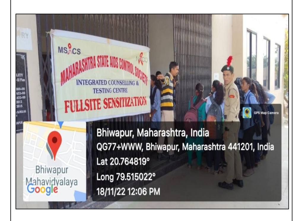
Students of our Institution making registration at the Registration Counter.