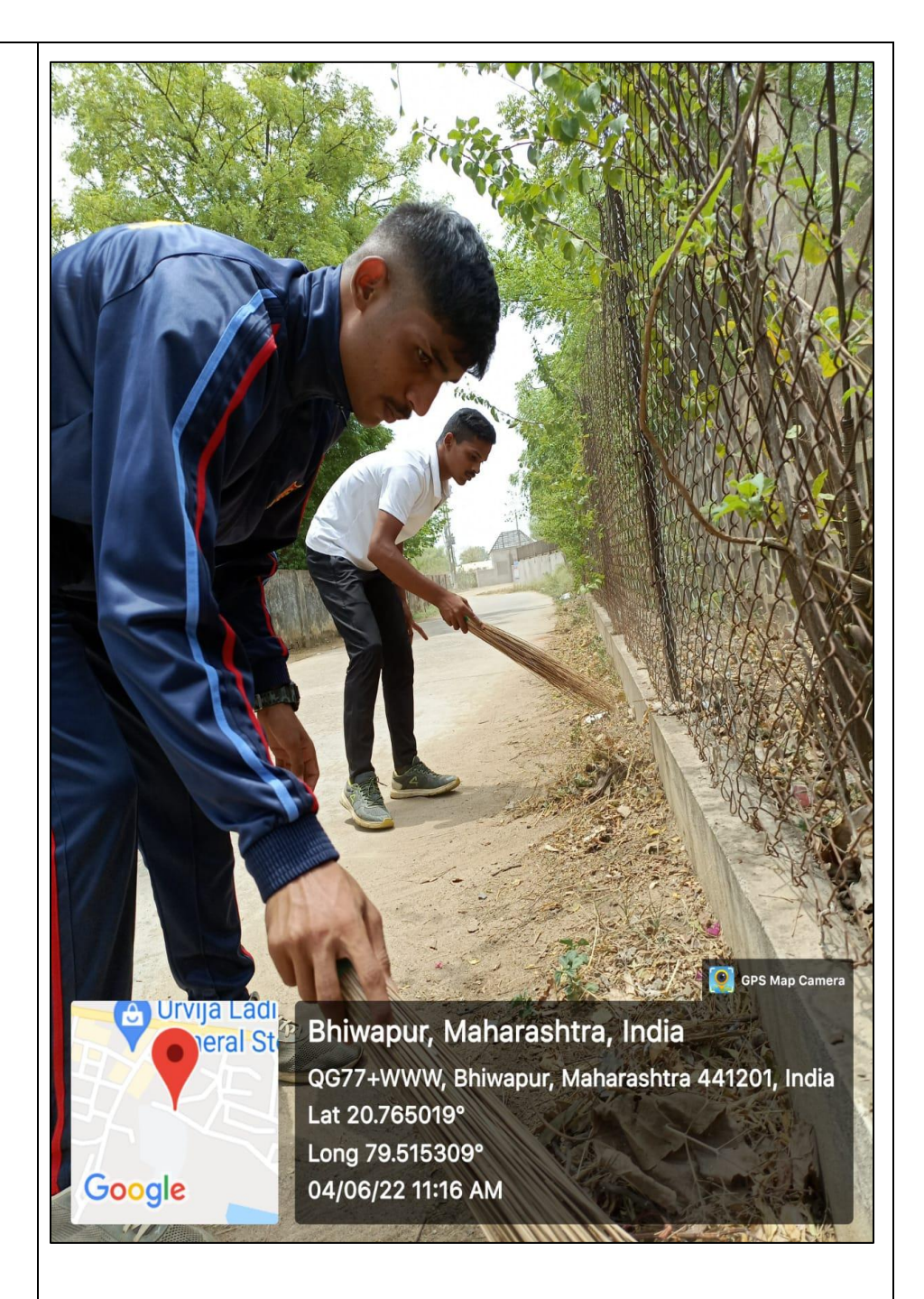
The NCC Cadets cleaning the streets during the 'Cleanliness Drive'.