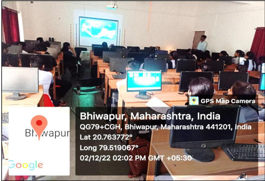
Screening of Documentary on pollution-related issues during the Programme