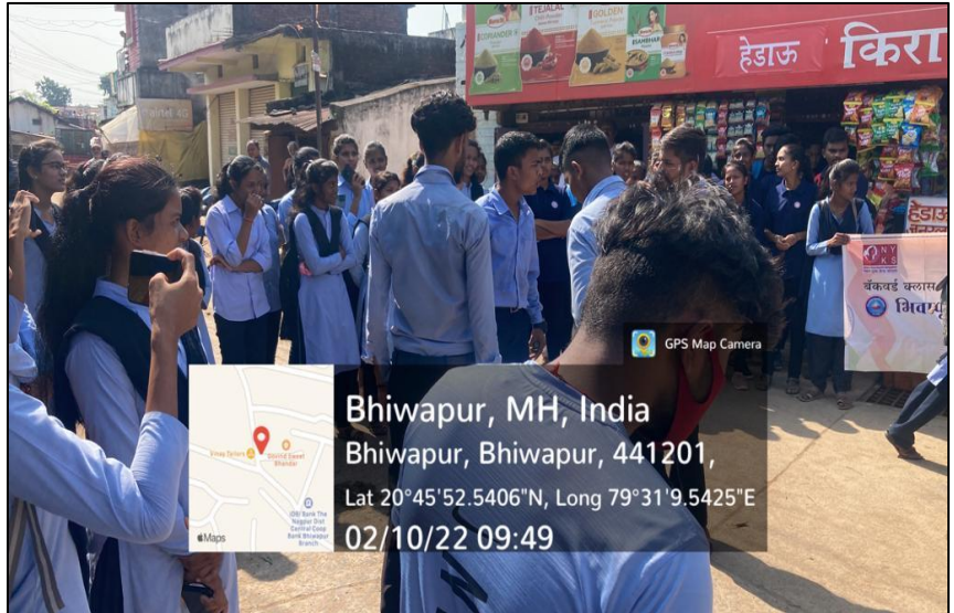
Students performing 'Street Play' on 'De-addiction'.