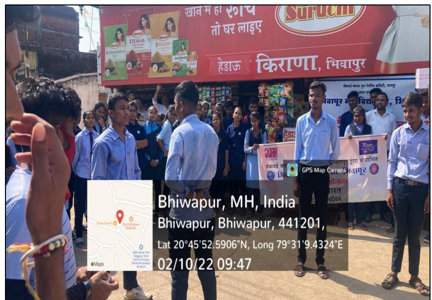
Students performing ‘Street Play’ on ‘De-addiction’.