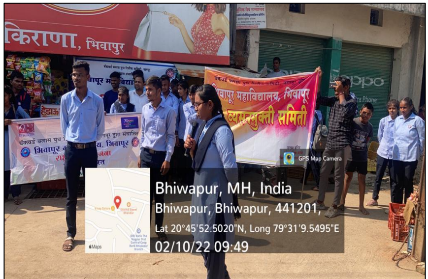
Students Performing 'Street Play' on 'De-addiction'.