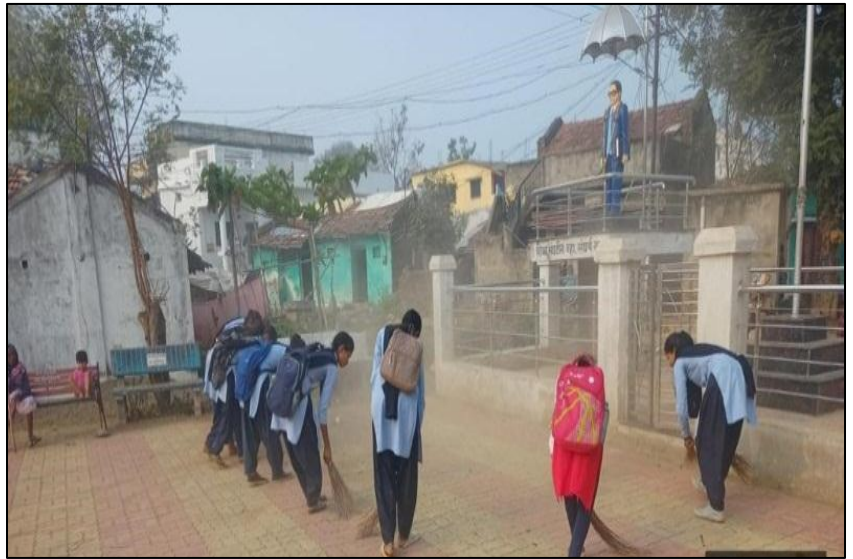
Students undertaking 'Cleanliness Drive', near Bhimadevi Temple