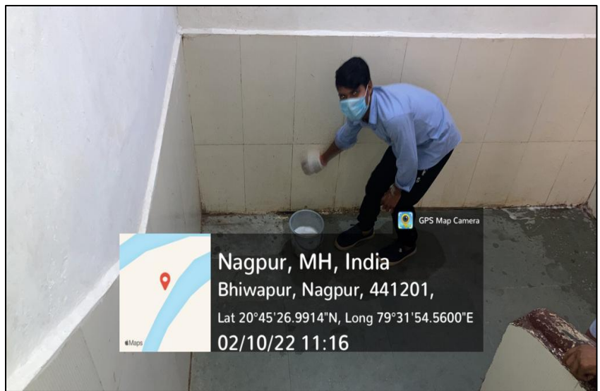
Students undertaking 'Cleanliness Drive'