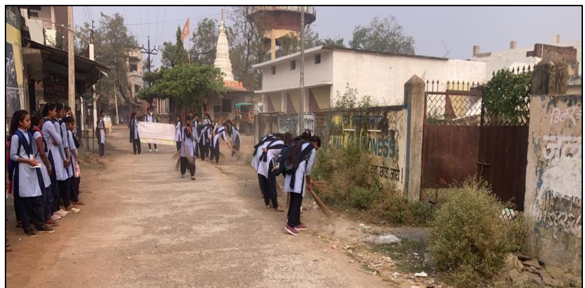
Students undertaking 'Cleanliness Drive'