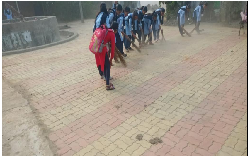
Students undertaking 'Cleanliness Drive' in Dharmapur Ward, Bhiwapur