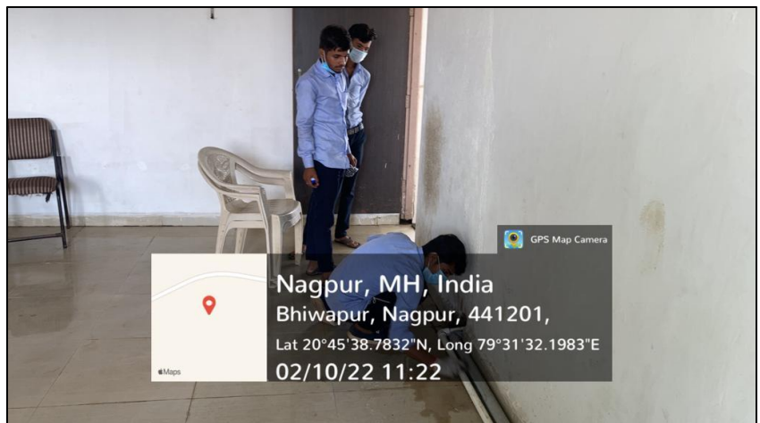
Students undertaking 'Cleanliness Drive'