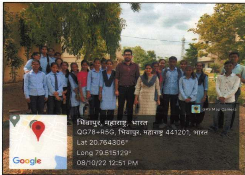
Gearing-up for the Wildlife Exploration Tour