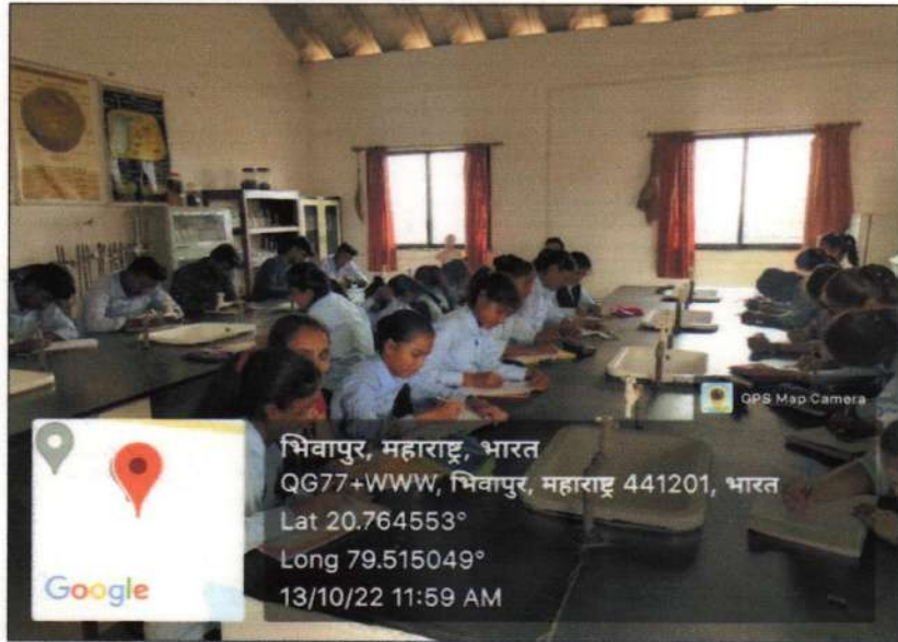
Students engrossed in writing slogans