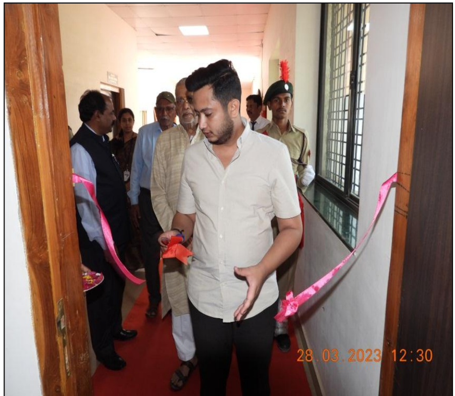
Hon. Yashraj Mulak inaugurating the Book Exhibition.