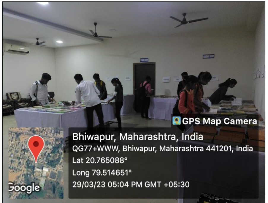
Students visiting the Book Exhibition