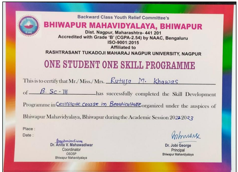
Specimen of the 'Certificate of Participation' awarded to the trainees upon successful completion of the Training Programme