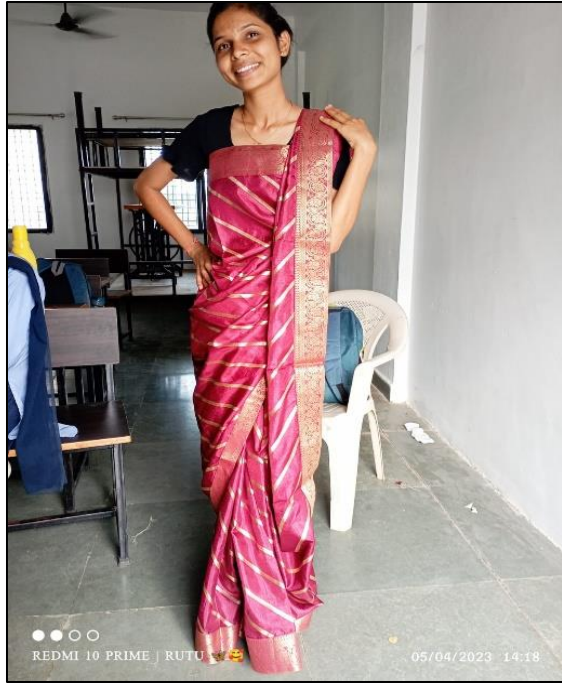
One of the trainees showcasing the art of Saree draping during the Training Programme.