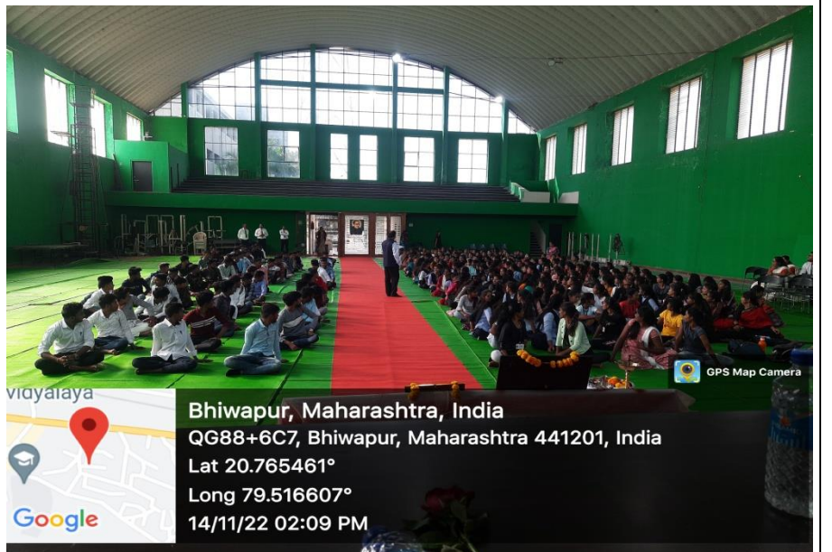
Programme at a glance