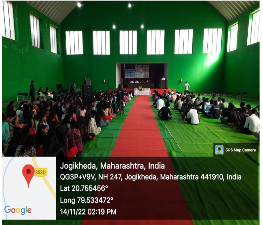
Programme at a glance