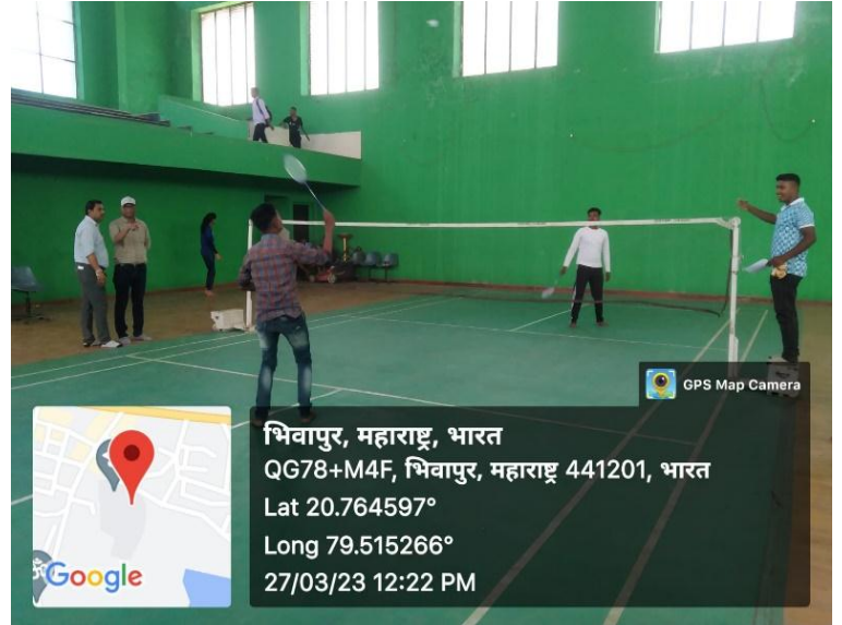
Boys, in action, during the Badminton Match during the Intra-Collegiate Annual Sports Meet on 27 th March, 2023 at Bhiwapur Mahavidyalaya, Bhiwapur.