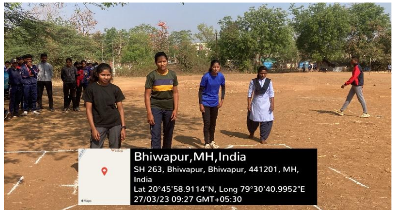
Students participating in 200 M Running Competition during the Intra-Collegiate Annual Sports Meet on 27 th March, 2023 at Bhiwapur Mahavidyalaya, Bhiwapur.