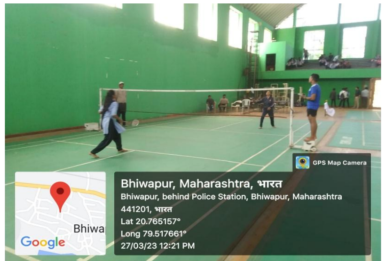
Girls, in action, during the Badminton Match during the Intra-Collegiate Annual Sports Meet on 27 th March, 2023 at Bhiwapur Mahavidyalaya, Bhiwapur.