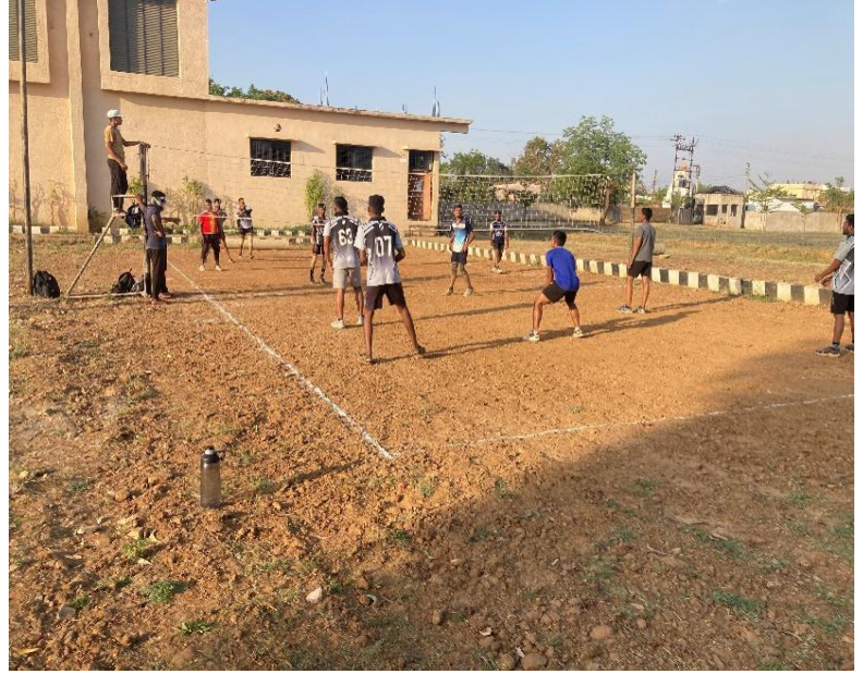
Boys, in action, during the Volleyball Final Match between M.A.-I and B.Com.-II during the Intra-Collegiate Annual Sports Meet on 27 th March, 2023 at Bhiwapur Mahavidyalaya, Bhiwapur.