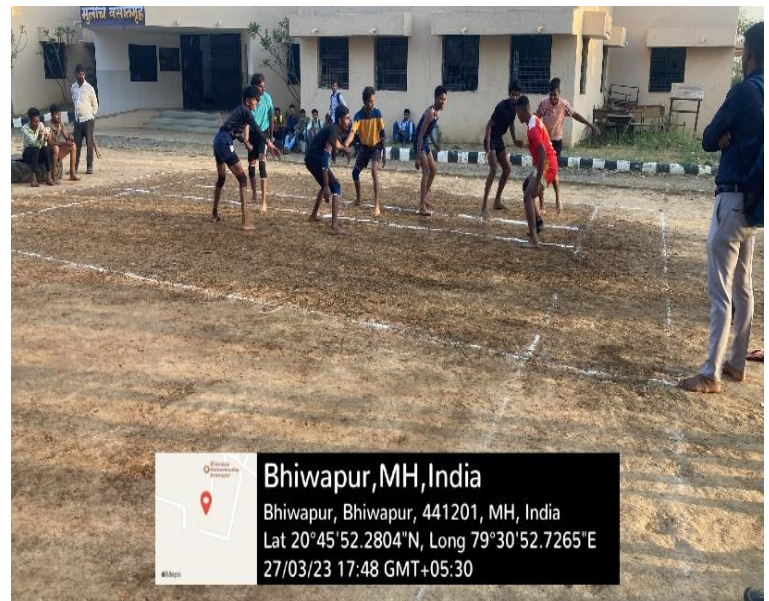
Boys, in action, during the Kabaddi Match between M.A.-I and B.Voc.-II during the Intra-Collegiate Annual Sports Meet on 27 th March, 2023 at Bhiwapur Mahavidyalaya, Bhiwapur.