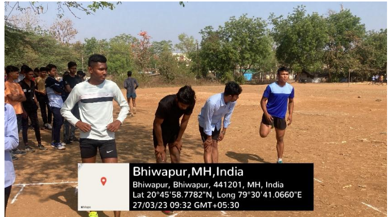
Sportspersons participating in 100 M Running Competition during the Intra-Collegiate Annual Sports Meet on 27 th March, 2023 at Bhiwapur Mahavidyalaya, Bhiwapur.