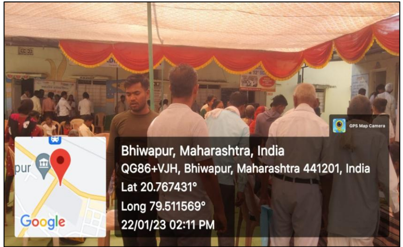
Glimpses of the people participating in the Mega Health Check-up Camp.