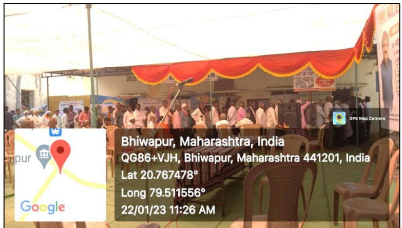
Visual of the people participating in the Mega Health Check-up Camp.