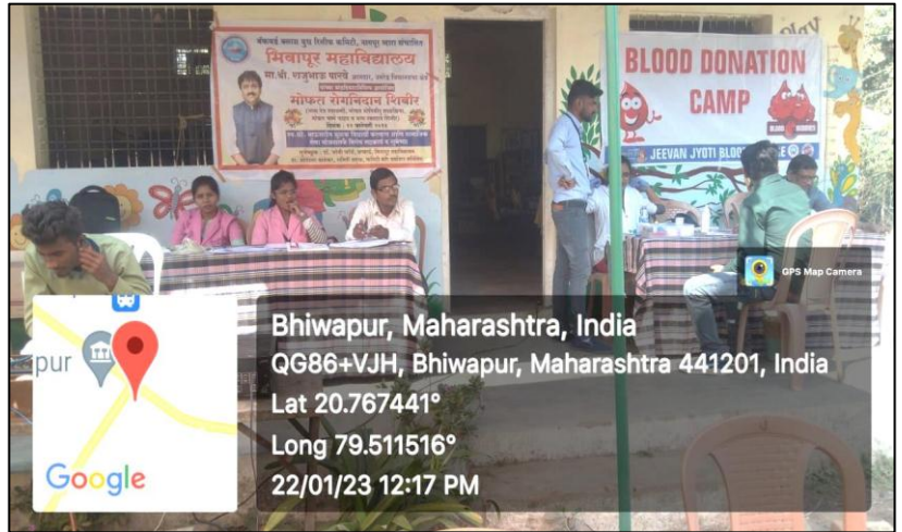
Glimpses of the people participating in the Mega Health Check-up Camp