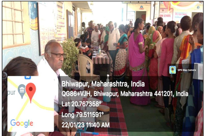
Visual of the people participating in the Mega Health Check-up Camp.

Principal Bhiwapur Mahavidyalaya Bhiwapur, Dist-Nagpur