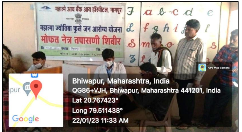
Visual of the people participating in the Mega Health Check-up Camp.