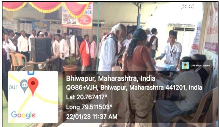
Glimpses of the people participating in the Mega Health Check-up Camp.