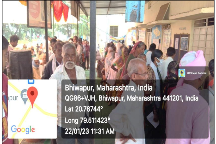
Visual of the people participating in the Mega Health Check-up Camp.