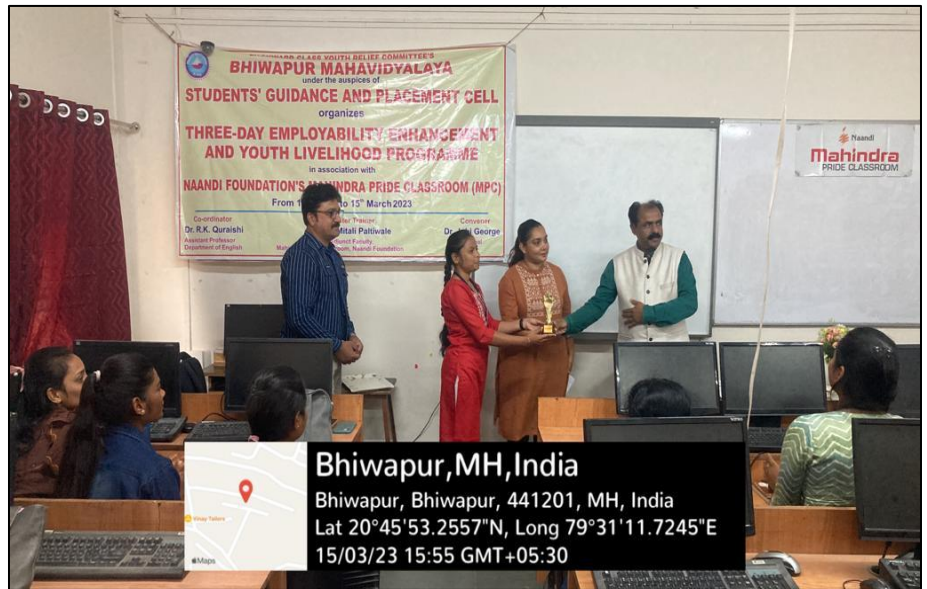
Dignitaries felicitating the outstanding Trainees