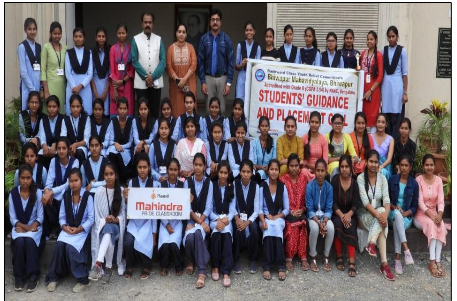
Group Photo of all the Trainees with Dignitaries