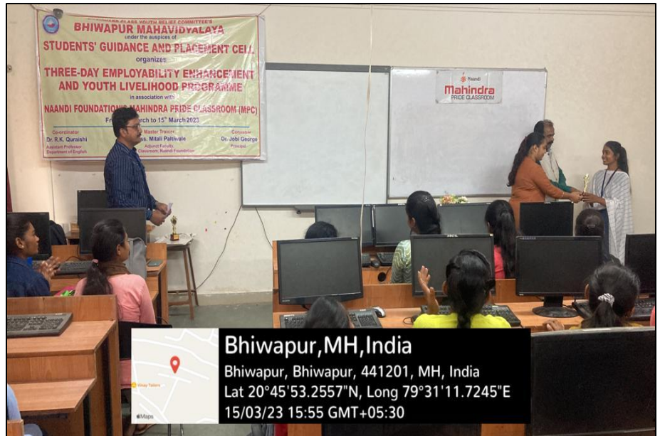
Dignitaries felicitating the outstanding Trainees