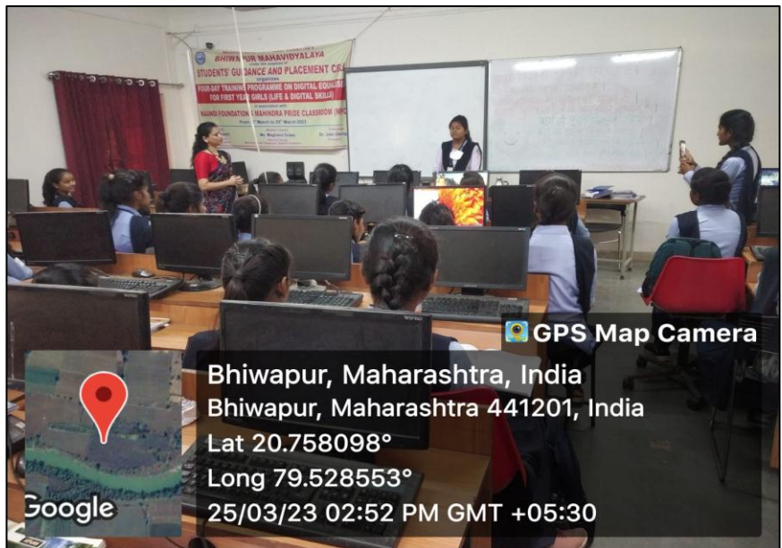
One of the trainees from Nutan Adarsh College, Umred, expressing her views about the Training Programme.