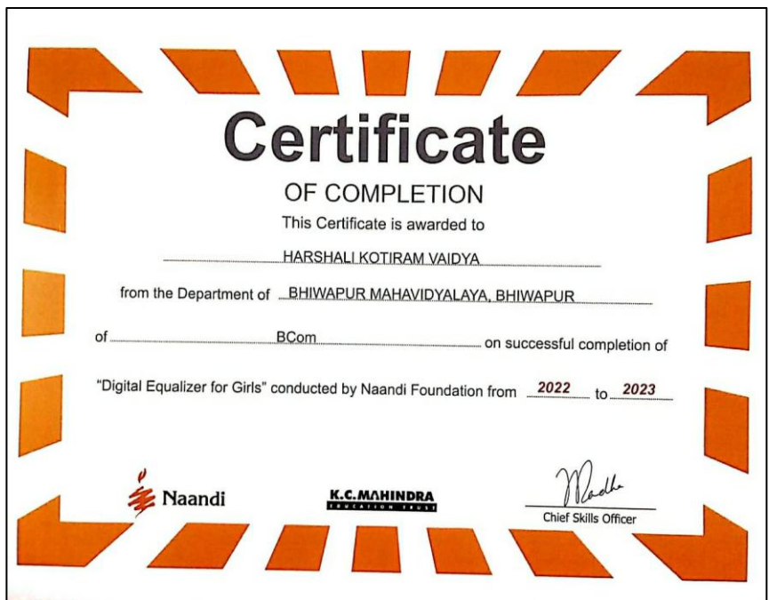
Specimen of the 'Certificate of Participation'