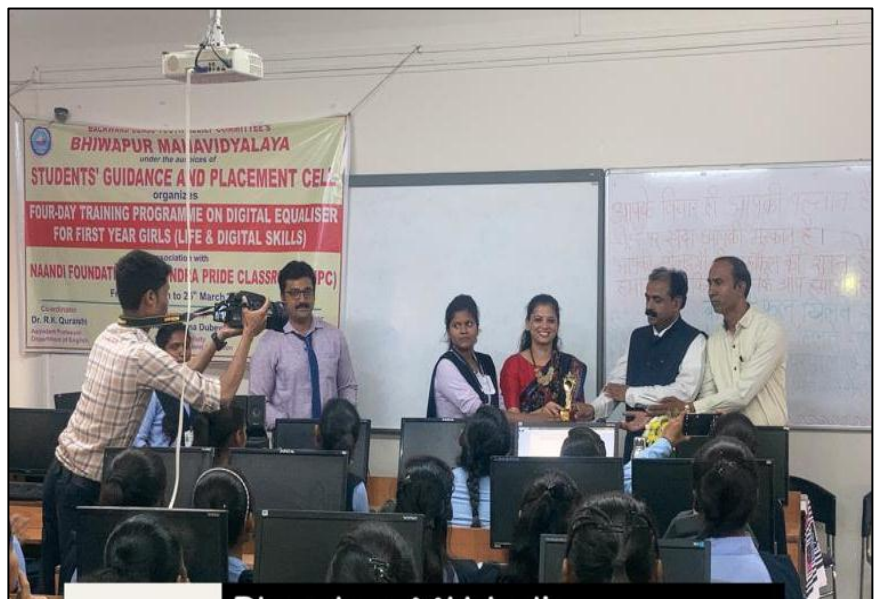
Dignitaries felicitating the outstanding Trainees