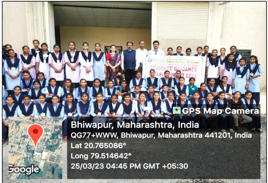
Group Photo of all the Trainees with Dignitaries