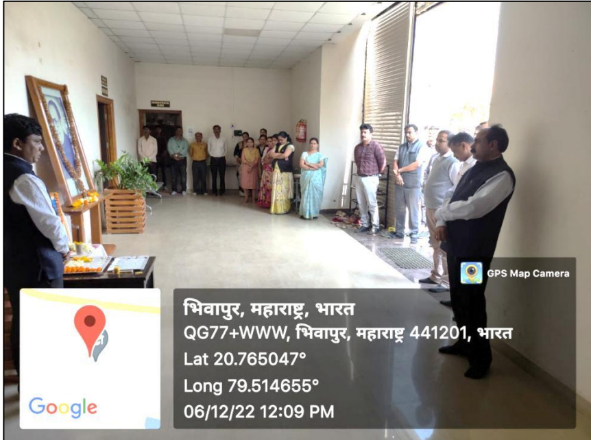
Staff of the College paid homage to Bharat Ratna Dr. Babasaheb Ambedkar by offering flowers on 6 th December, 2022.