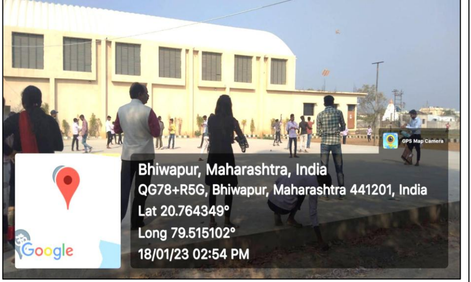
Students participating in 'The Patang Mahotsav' Competition.