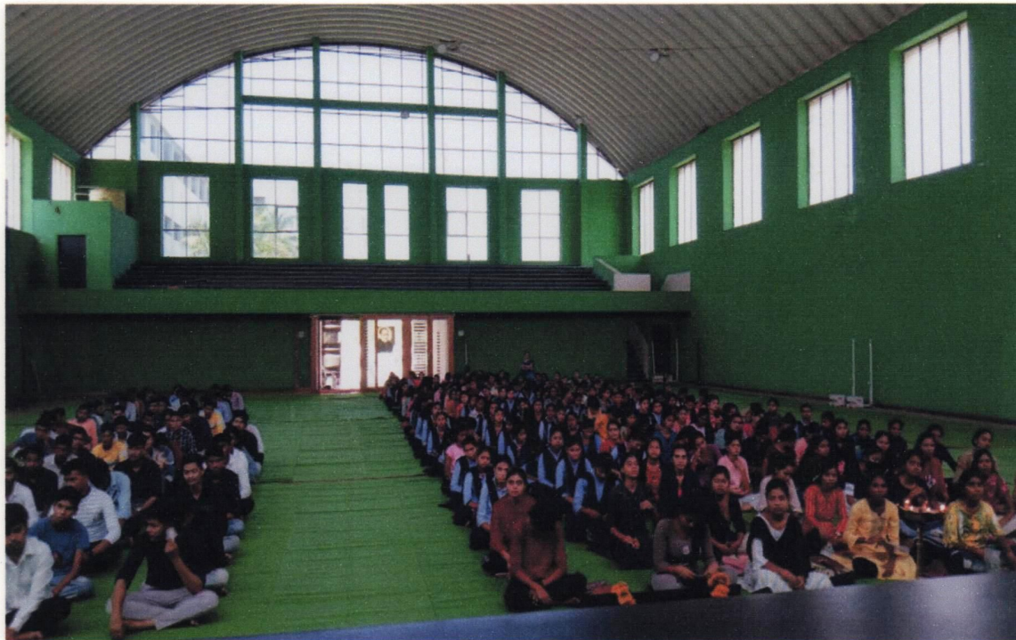
Students attending the Students' Induction Programme