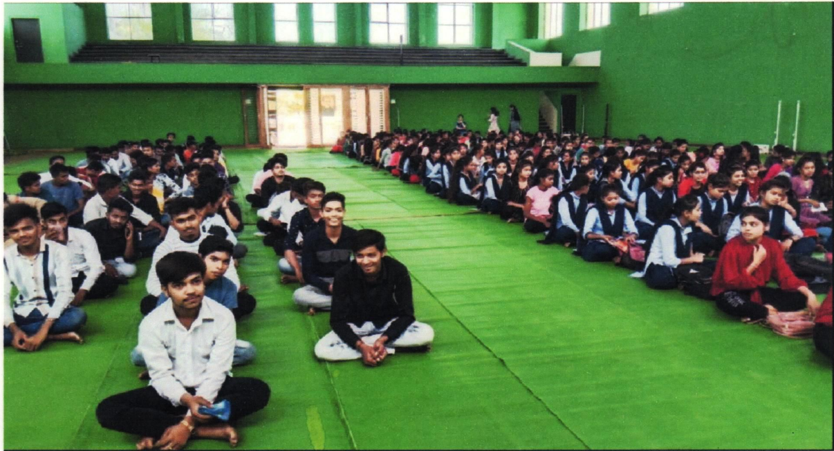
Students participated in the programme