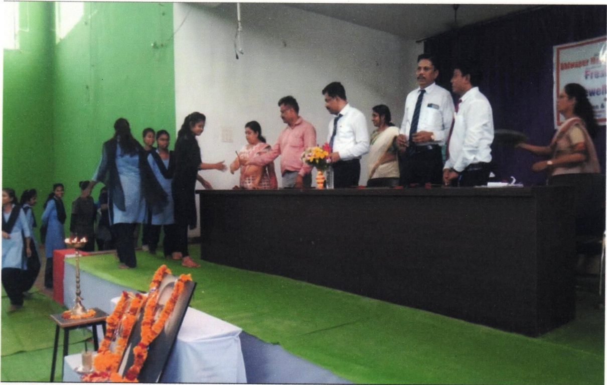
On the occasion of The Students' Induction Programme distributed gifts among the of First Year students