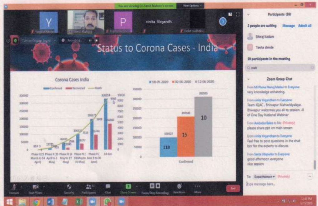
Slide of the Presentation