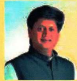
Hon. Shri. Rajendraji Mulak Ex. Minister of State (Govt. of Mah.) Secretary